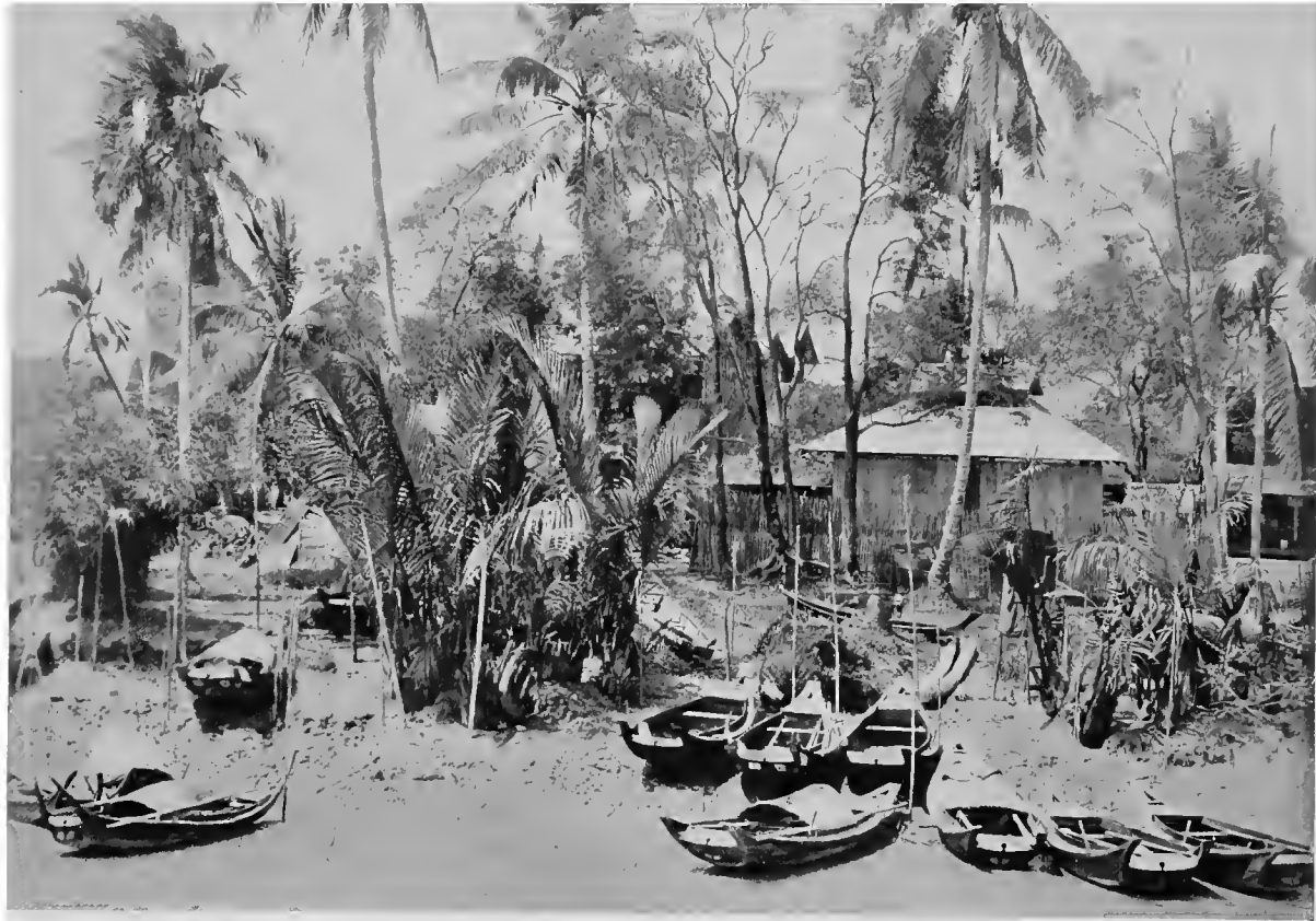
Burmese Village on the Irrawaddy